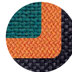
Camira 'Advantage/Era' seating fabric options