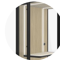
Lighting upgrade with facial illumination