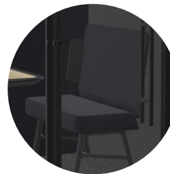
Bench style seating with back rest