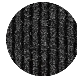
Heavy duty ribbed carpet