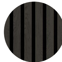
Black stained wooden slatted external end panels