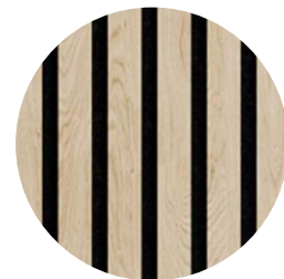
Wooden slatted panels in a light oak finish